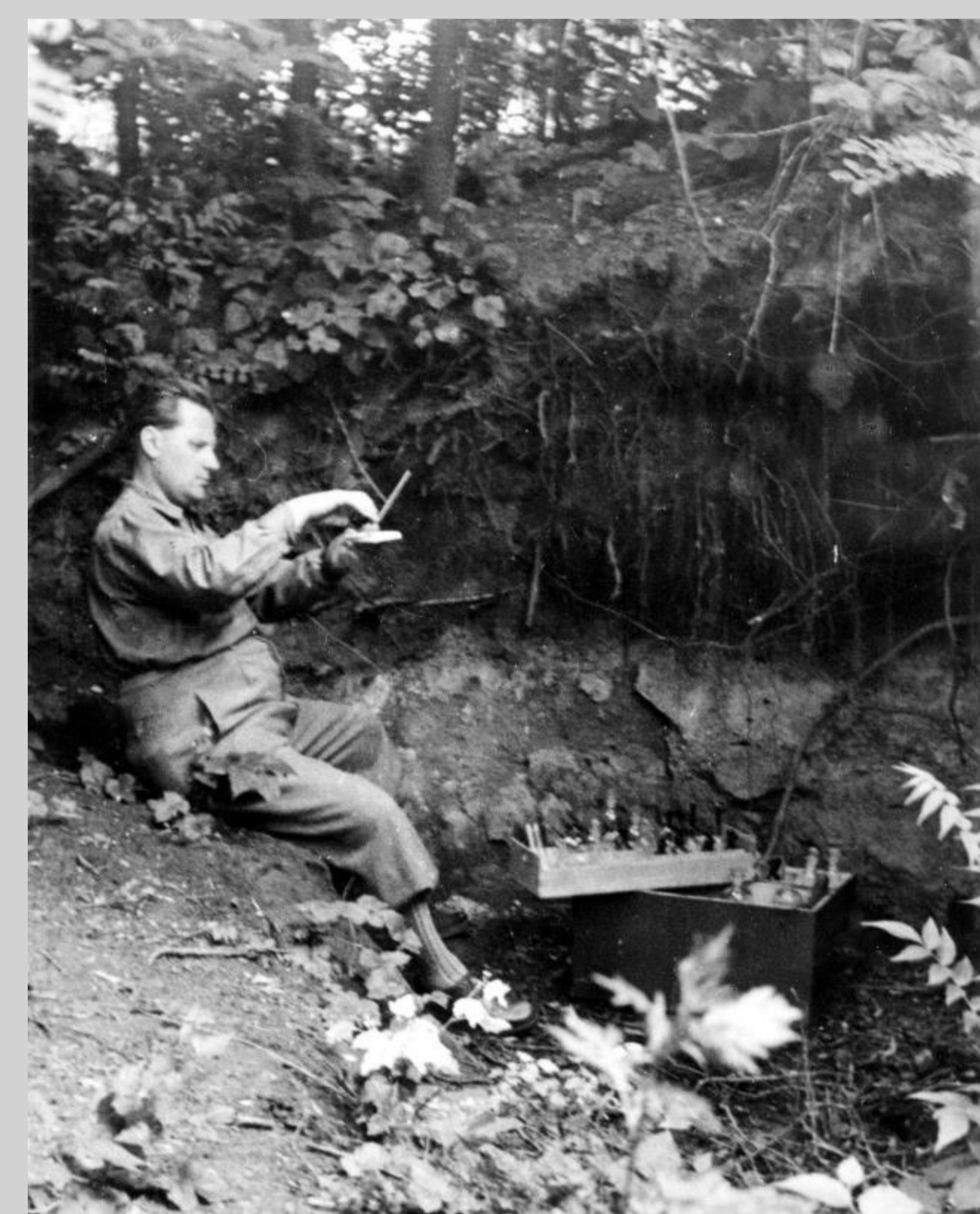
Testing the soil