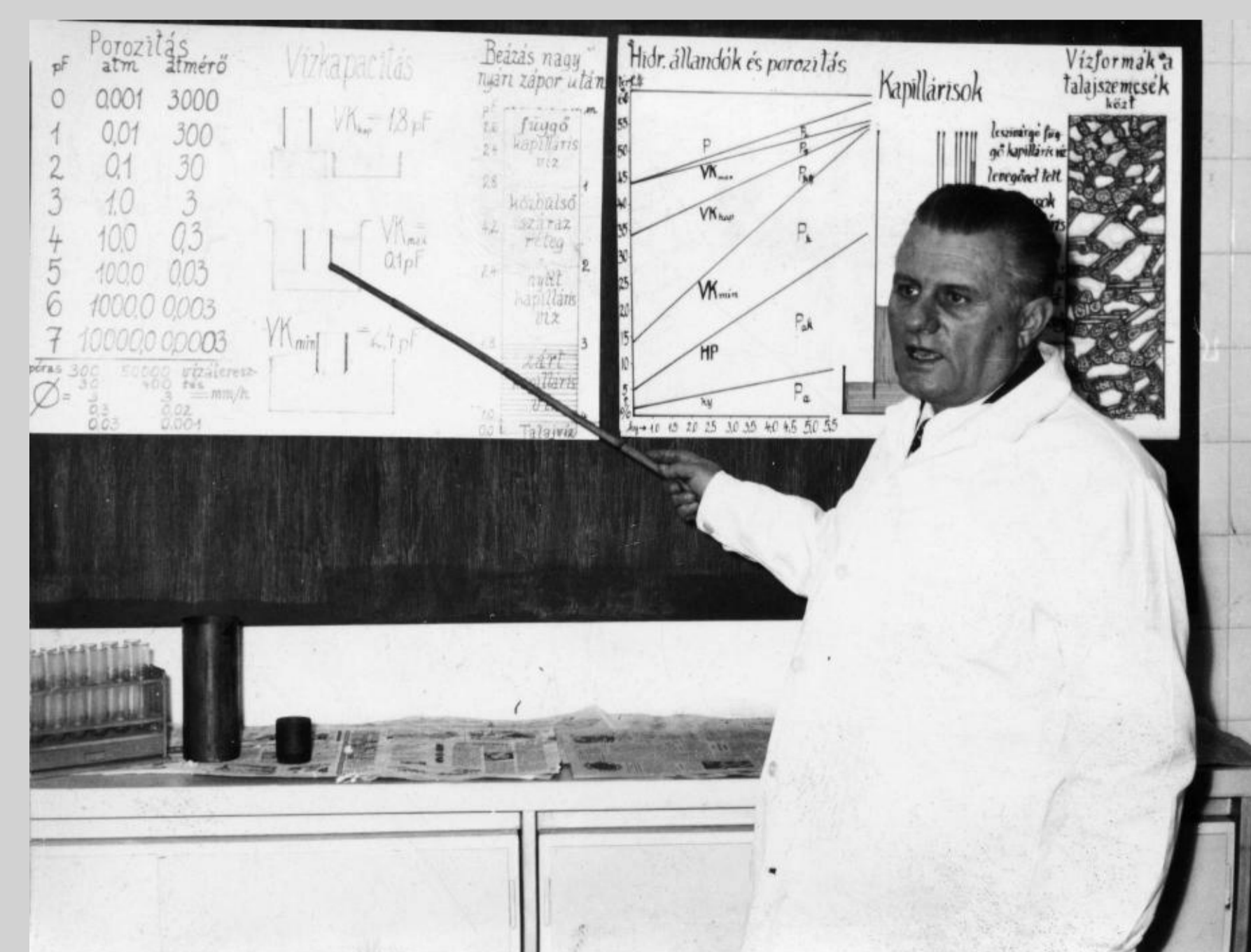
Presentation in the classroom