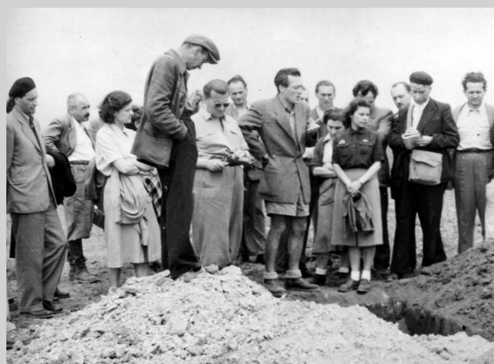
Presentation in the field